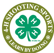
2024 Shooting Sports Dates

*Guidelines for Classes and equipment will be same as the current rulebook. You may view the Colorado Shooting Sports Rule Book at: http://co4h.colostate.edu/program-areas/shooting-sports/ . Click on rulebook, forms, and notices.