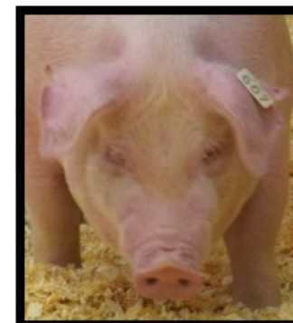
Color Photo Example