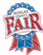
Exhibit at the County Fair!

Colorado State University Extension es un proveedor que ofrece igualdad de oportunidades. | Colorado State University no discrimina por motivos de discapacidad y se compromete a proporcionar adaptaciones razonables. | Office of Engagement and Extension de CSU garantiza acceso significativo e igualdad de oportunidades para participar a las personas quienes su primer idioma no es el inglés.